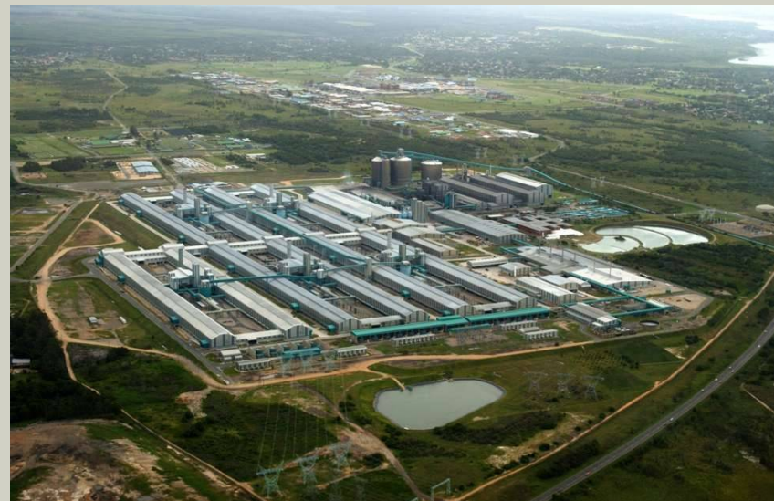
BHP Billiton's Hillside Smelter, Richards Bay, South Africa