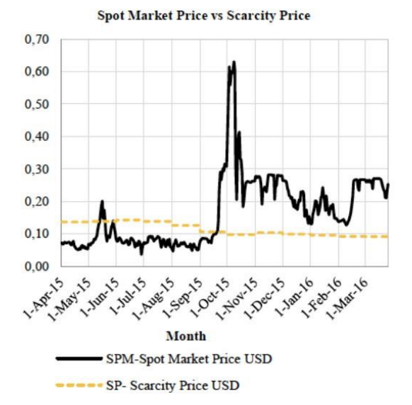
Figure 1. Comparison between the Scarcity Price and the Spot Market Price in Colombia, 2015. Note: The prices were converted into US$.

1 Introduced a cap price on the spot market equal to 75% of the first level of Incremental Operational Cost of Energy Blackout.