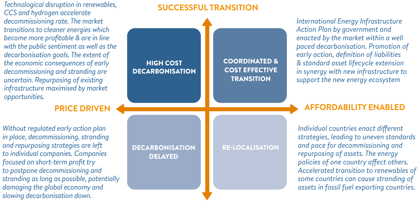
Figure 9: Future Outlook- Infrastructure's impact on decarbonisation

The transition to a new energy future cannot be predicted but it can be better prepared for using scenarios. Four scenarios are provided, each reflecting a plausible but different infrastructure transition pathway. Combined with a long-term shared vision it is possible to catalyse and guide an integrated approach to decommissioning, repurposing, life-cycle extension while minimising the risk of stranded assets.